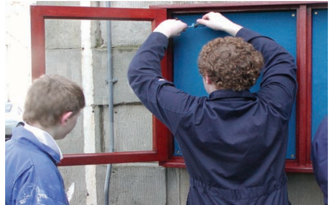
3rd Year pupils installing the refurbished notice board

A completed log of work and an account sheet was kept by each pupil detailing their individual involvement and the costs of materials, bus fares, etc.